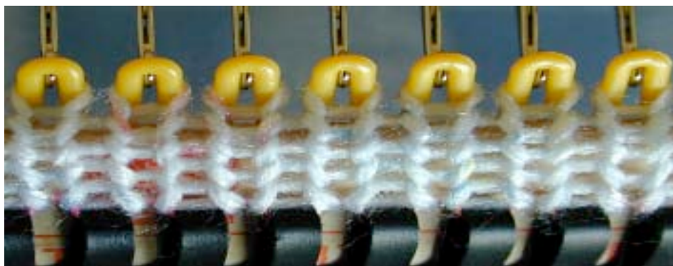
Illustration 3 Stitches, but not prongs, are in the needle hooks

Rehang the stitches In this next maneuver, you want to get the turned stitches off the garter bar and into the needle hooks. Make sure the needles are fully forward and the latches are open. Lower the bar over the needles extending it away from you so the stitches on the bar are centered and just a little behind the needle hooks. Continue to lower the bar until you feel it touch the needles and then slowly bring the bar towards you scraping the stitches off into the hooks as shown in Illustration 3. Don't panic if a few stitches don't cooperate. You can guide them where they belong later. Note that the bar shouldn't end up in the needle hooks, just the stitches. Easy for me to say!