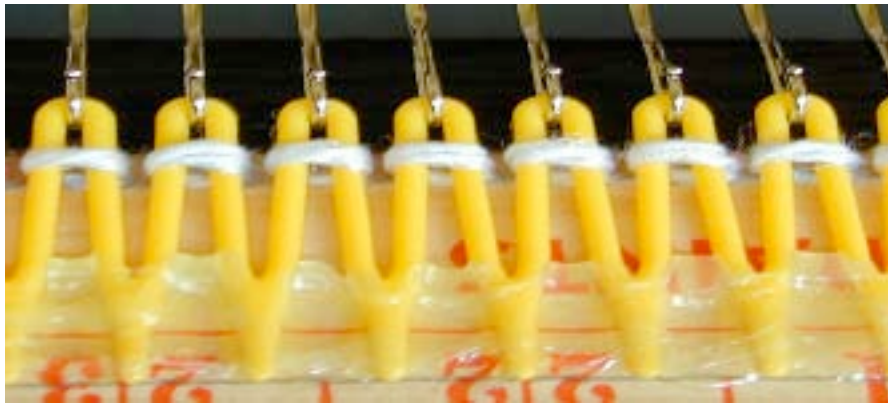
Illustration 2 The difficult part is over

have done the hardest part. The bar can actually hang on the needles while you compose yourself if necessary. A piece of chocolate might be in order.