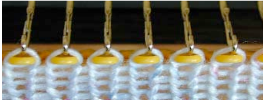
Illustration 4 Note that the bar is rotated at an acute angle so the bar can be removed

Remove the bar You are now ready to remove the bar. There is a trick to this part. You have to get the bar free from the needle hooks while leaving the stitches in the needle hooks. Start by rotating the bottom of the bar away from you so it is clear of the hooks as shown in Illustration 4 and pull downward and back until it slides out of the stitches.